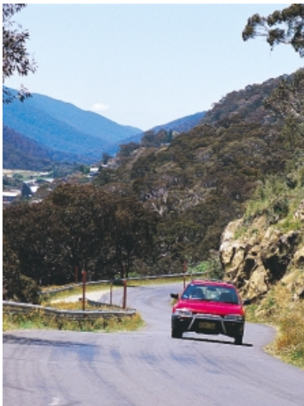
Kosciuszko Alpine Way

This Paper provides a brief overview of some of the high priority strategies that will be implemented for the benefit of the Snowy Mountains Region.