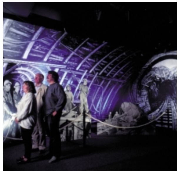
Snowy Hydro Scheme

Assistance for the preparation of the Tourism Plan was provided by the Department of Employment, Workplace Relations and Small Business and by the South East NSW Area Consultative Committee.