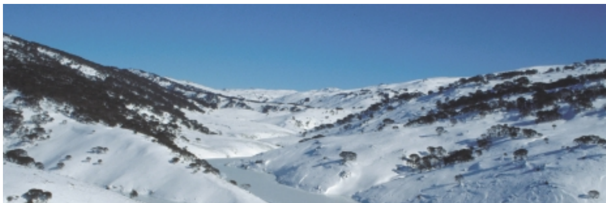
Winter in the Snowy Mountains